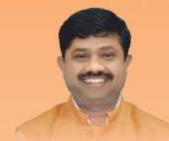
Nand Gopal Gupta 'Nandi' Minister of Industrial Development, Uttar Pradesh