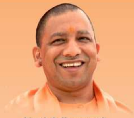
Yogi Adityanath Chief Minister, Uttar Pradesh