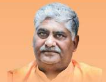
Jaswant Saini Minister of State for Industrial Development, Uttar Pradesh